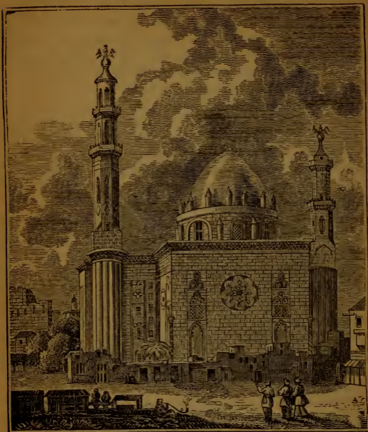
Mosque of Sultan Hassan.

with the mysterious Nile flowing in the midst of this land of its own creating. But let us turn from the view for a mo-